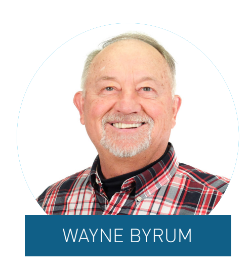
Nominated for: Elder (non-Session)

Ordination as a non-Session Ruling Elder does not make that person a board member, but can serve as an affirmation of their ministry, provide a sense of spiritual weightiness, and bring them under the authority of Session and of Presbytery.