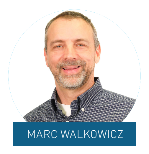
Nominated for: Deacon

Statement of faith and why you feel called to this office: I believe that Jesus Christ is the Son of God who died to cover the sins of all who would receive Him. I accepted this gift as a child and continue to believe this truth. I try to study His word and live according to it. I have recently served as a deacon on the Care Team and would be blessed to continue to do so.