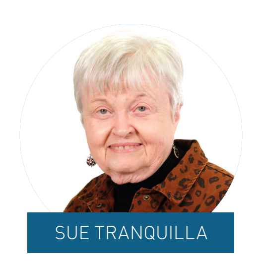
Nominated for: Deacon