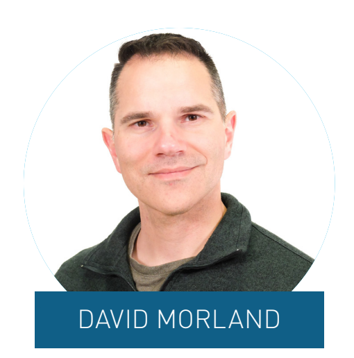
Nominated for: Trustee

Statement of faith and why you feel called to this office: Although I was raised in a Catholic home, I was mostly spinning my wheels as a good "ChrEaster" Catholic for the majority of my childhood. I truly discovered the love of Christ in my freshman year of college through campus ministry groups, and had my re-dedication/baptism in a frozen lake in mid-Michigan. Ever since, I've worked to learn more about Christianity as well as tried to walk more like Christ every day. I feel called to be a Trustee to put my prior military experience, my experience as a Security and Production volunteer at Ward, and my experience in the IT field to work for the church.