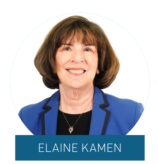
Nominated for: Nominating Committee

Statement of faith and why you feel called to this office: I feel blessed to have had a mother who not only cared about me physically but also spiritually. We attended a small church where I first became aware of my need for a Savior. It was there that I also developed my beliefs. I believe in God the Father and in Jesus Christ, God's Son. I believe in Christ alone, through personal repentance, I can be forgiven. I believe in the gift of the Holy Spirit and the Bible as God's infallible word. As a believer, I am called to glorify God, love my neighbors and share the hope I have within me. I feel called to serve as I was asked. I feel I have the time and I know many members due to my longevity at Ward.